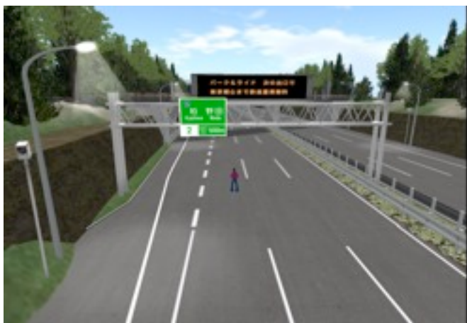
Realistic Road Environment