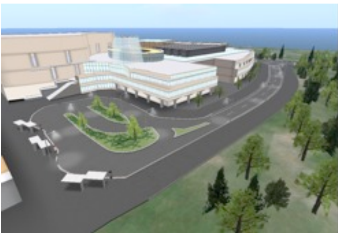
Public Transport Facilities